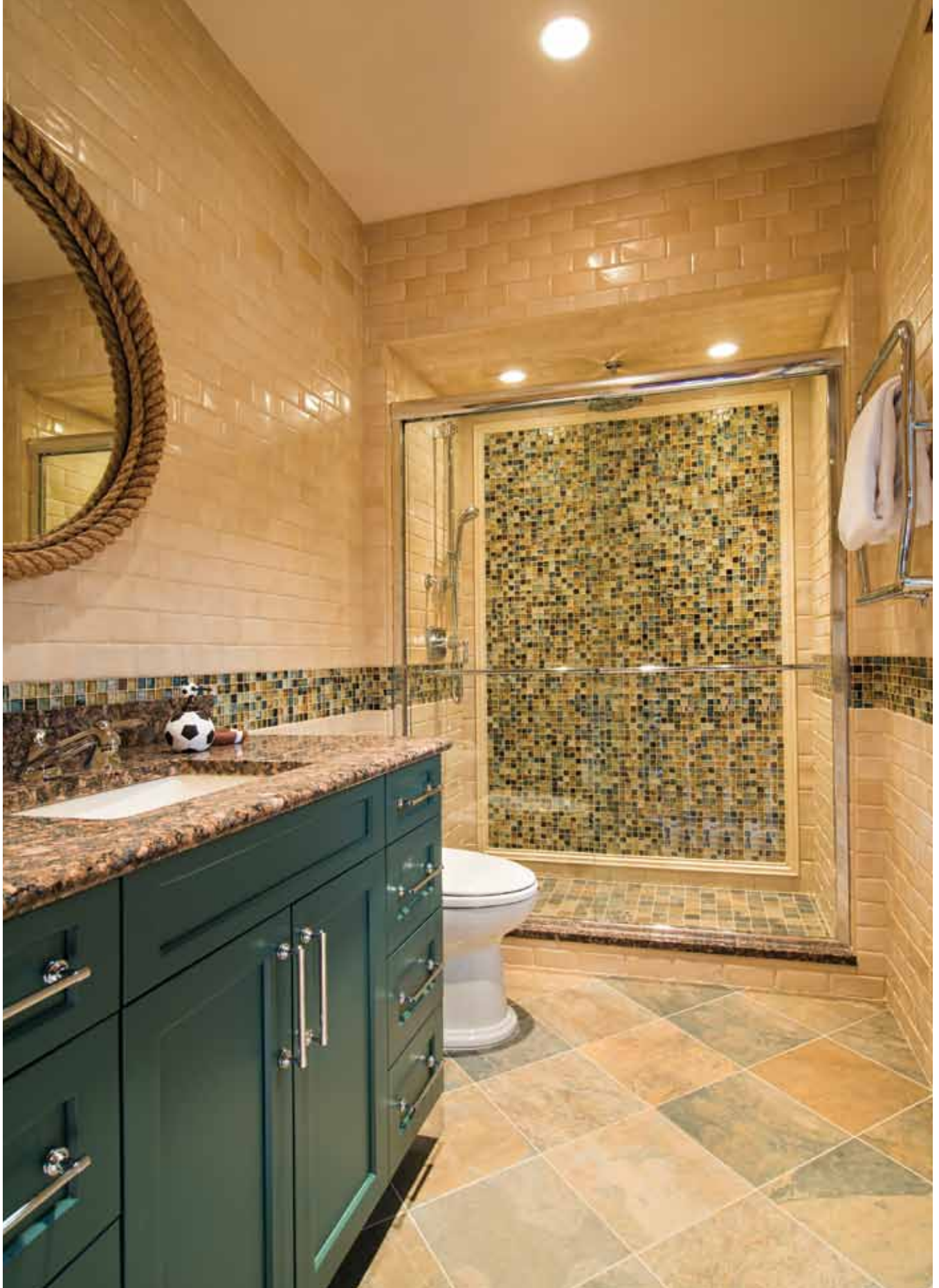
The flooring in the bathroom of the eldest son features the Landscape Valley Collection from Ceramica Sant'Agostino in 12- x 12-inch format, and the same material in 2- x 2-inch pieces were employed for the shower floor. The walls are clad in Ceramiche Sadon 3- x 6-inch Silk Honey subway tiles in an offset pattern and a feature wall is created with colorful glass mosaics. Tile Manufacturer: Ceramica Sant'Agostino, Italy