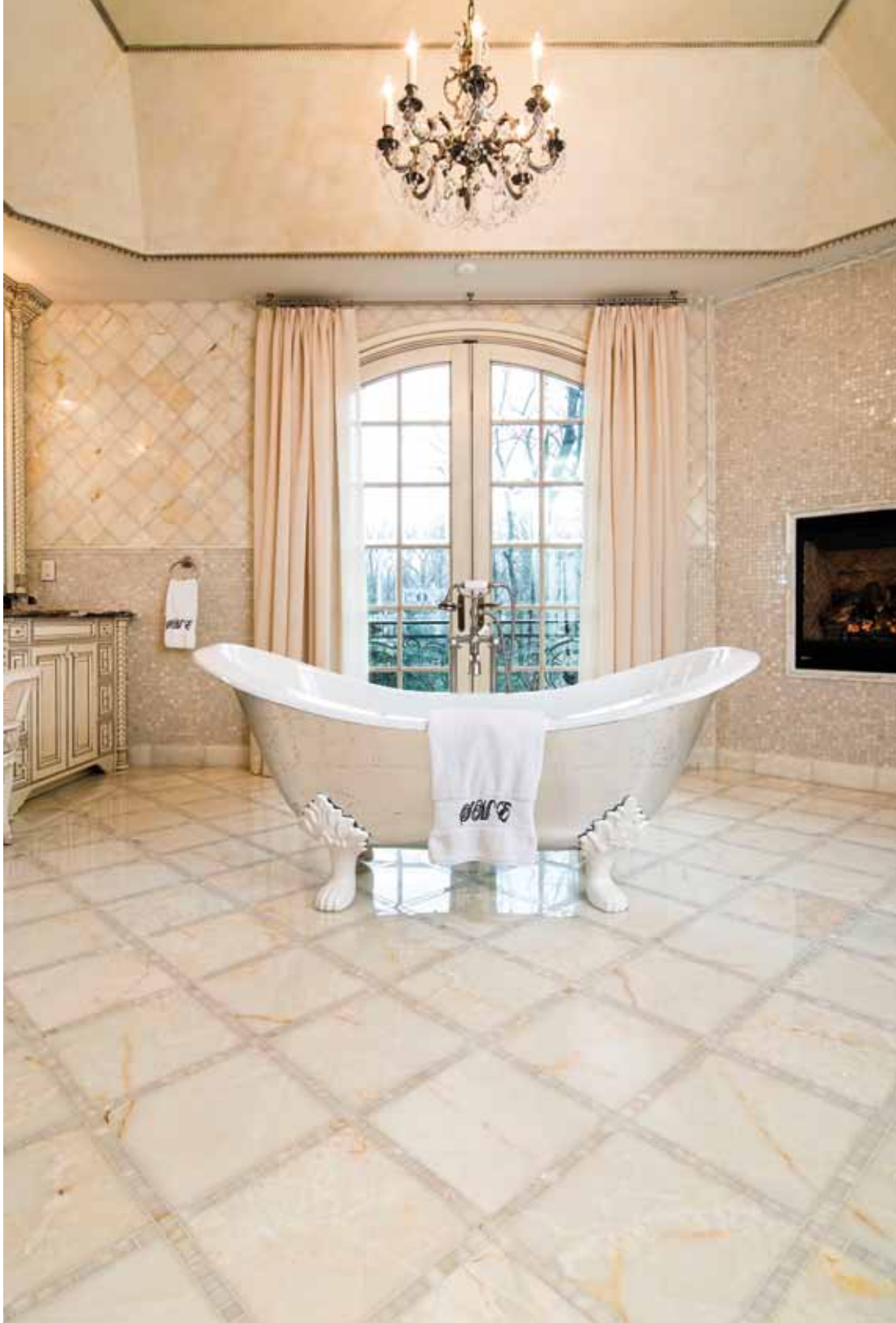
The marble tile is accented with Rojo Alicante polished marble from Spain and three different patterned stone etchings from Italy. (opposite page) A luxurious retreat was created in the master bath with 12- x 12-inch white onyx floor tiles separated by 1- x 1-inch mosaics, which created a visual interest in the space. White onyx was also used in 6- x 6-inch format and mosaics to clad the walls.