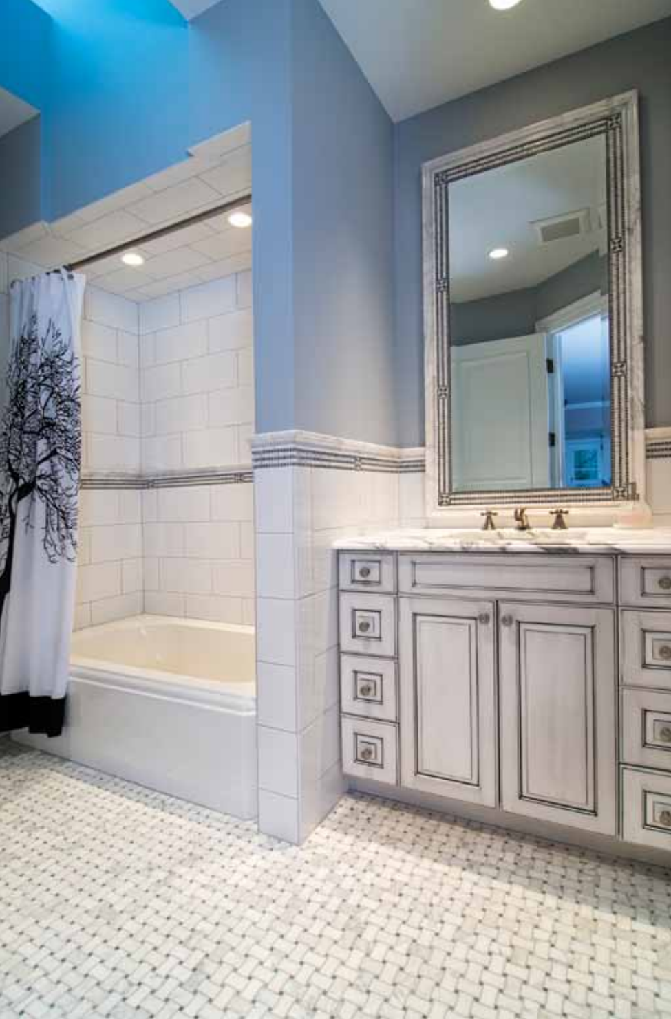
A crisp yet elegant design was created in another guest bath with white wall tile from the Hall Collection by Imola Ceramica. Tile Manufacturer: Imola Ceramica, Italy

installed in an offset pattern to add texture and dimension to the space," explained Fanelli. Both boys' bathrooms include a feature wall and border made of colorful glass mosaics.