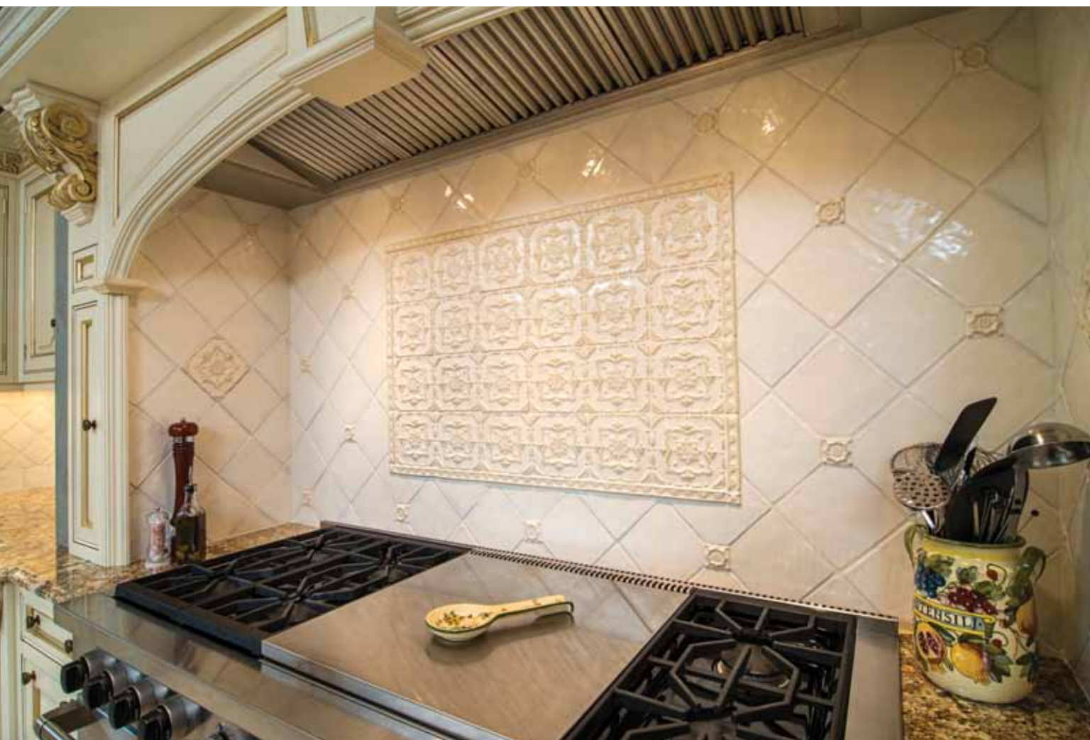
A detailed custom tile backsplash adds to the elegance of the space.